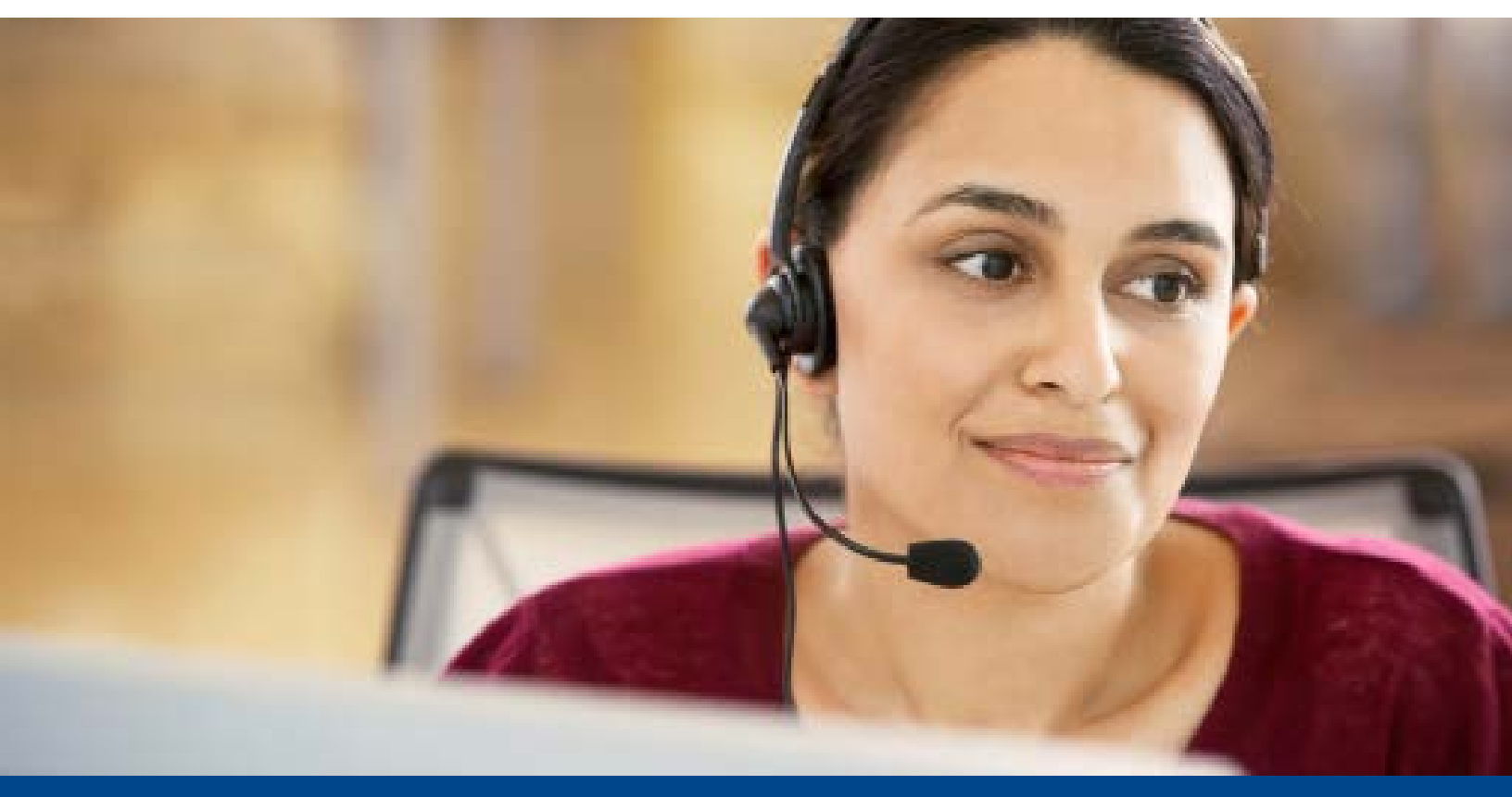
Personalized Support | Trusted Guidance | 24/7 Access